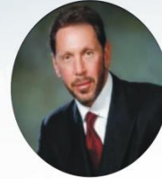
LARRY ELLISON $78 Billion