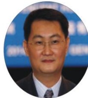
MA HUATENG $36 Billion