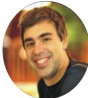
LARRY PAGE $47 Billion