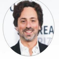
SERGEY BRIN $51 Billion