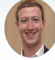
MARK ZUCKERBERG $71 Billion