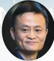
JACK MA $84 Billion