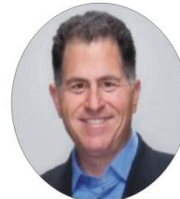
MICHAEL DELL $22 Billion