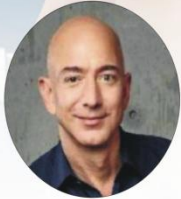
JEFF BEZOS $117 Billion