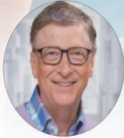
BILL GATES $107 Billion