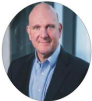
STEVE BALLMER $49 Billion